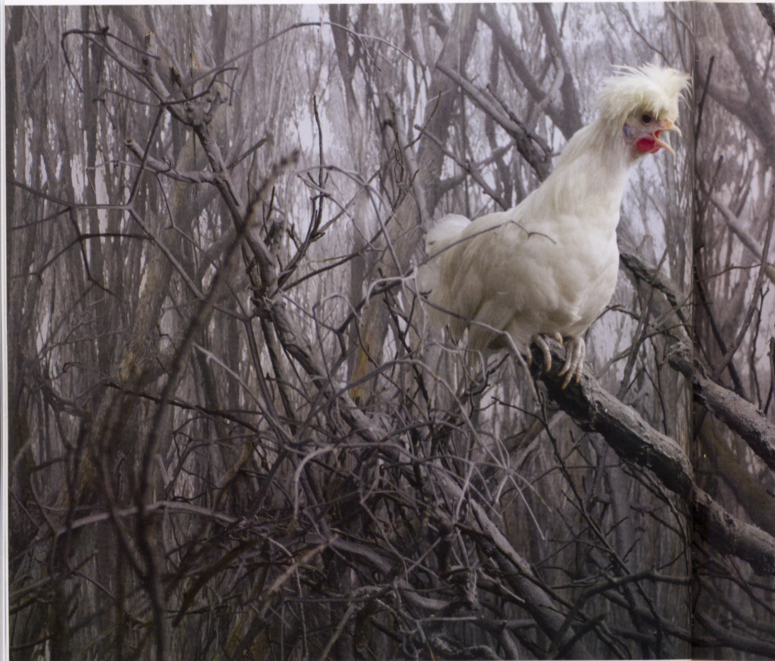
ABOVE: HAYDEN FOWLER, NEW WORLD ORDER (PRODUCTION STILL VIII), 2013